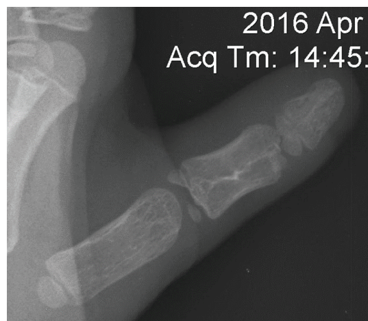
Figure 3. X-ray examination after two-stage modification of Bilhaut-Cloquet procedure (follow up 5-years).

in MCP and IP joints was measured and X-ray was performed (Figure 3).