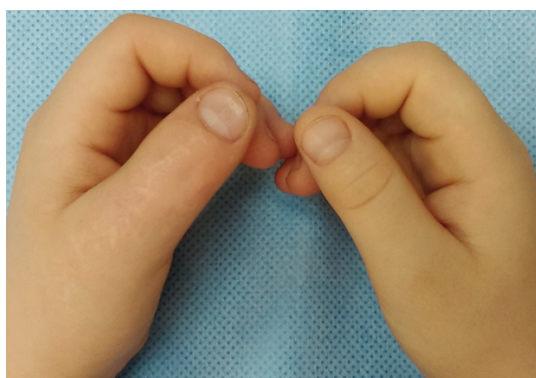
Figure 4. Aesthetic outcome after two-stage modification of Bilhaut-Cloquet procedure (follow up 5-years).

Almost all patients had a dorsal linear thickening (scar-associated) on a nail plate without significant cosmetic defect. In some cases this line was barely visible (Figure 4).