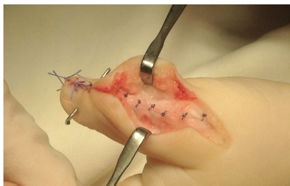
Figure 2. Suture of a dorsal aponeurosis.