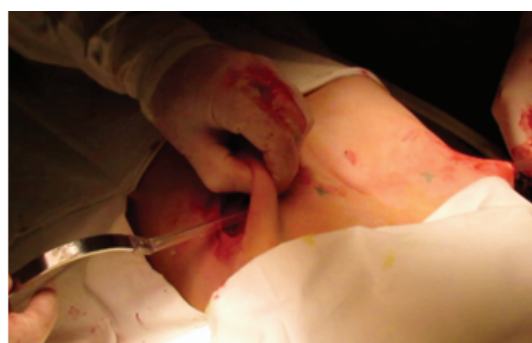
Figure 4. Retrosternal bar drawing with silicone suction connecting tube.

The skin incisions are elevated and previously marked the intercostal space at the edge of the sternum is identified. The pectus introducer with conical tip is inserted under the sternum in this point, slowly advanced across the anterior mediastinal space immediately under the sternum with careful videoscopic guidance. As the instrument is passed to the contralateral side and sternum