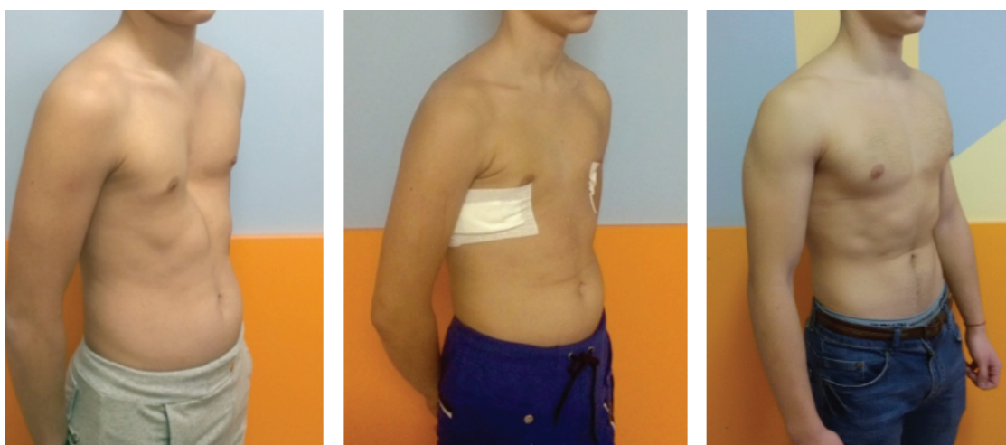
Figure 6. Patient with pectus excavatum before surgery, after operation, 1 year after bar removal.

The bar was removed with no surgical or postoperative complications in 3 patients, with the results remaining constant and the implant remaining in place a mean 20 months (range, 18–24) (Figure 6.).