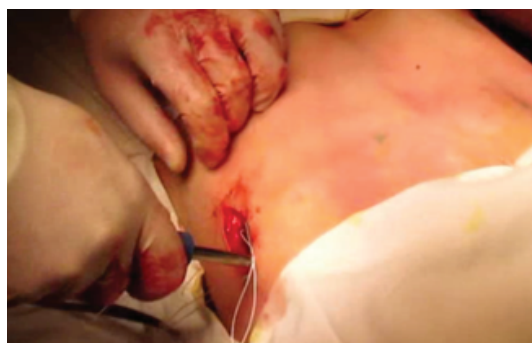
Figure 5. Rotating maneuver with bar tilters.