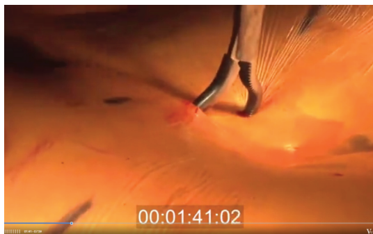
Figure 3. Sternum elevation.

the previously selected intercostal space at the edge of the sternum are performed. Inserted bone forceps grasped the sternum and elevated it (Figure 3).