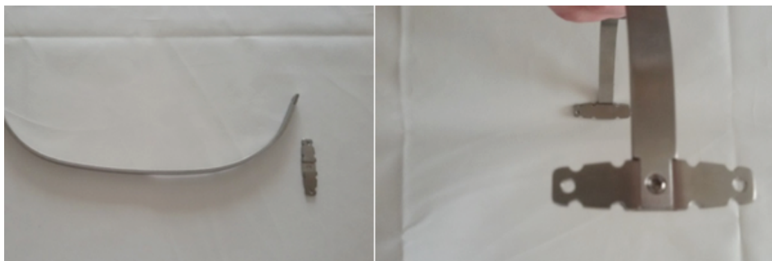
Figure 1. Retrosternal fixator, stabilizers and submerged screws.