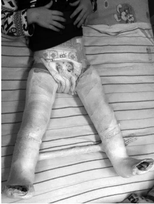
Figure 3. The principles of immobilization - long leg splints.

The mean points of improvement by OGS was used to determine the effectiveness of treatment.