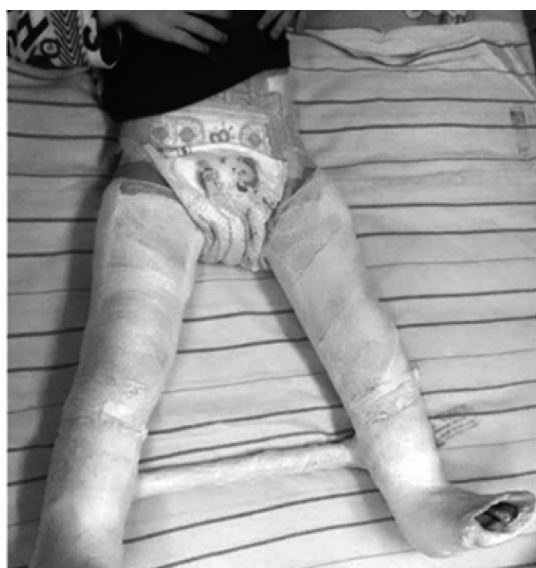
Figure 3. The principles of immobilization – long leg splints.

Long leg splints immobilization with abduction of hips about 30 degrees, extension of the knees and 90 degrees of foot dorsiflexion was used after surgery. Short leg cast was used in case of Evans osteotomy. Rehabilitation began next day after operation. The initial goal was to teach the child to stand and walk in the splints. Splints were removed 2–3 weeks after the operation. Then orthoses were made and rehabilitation was continued (Figure 3).