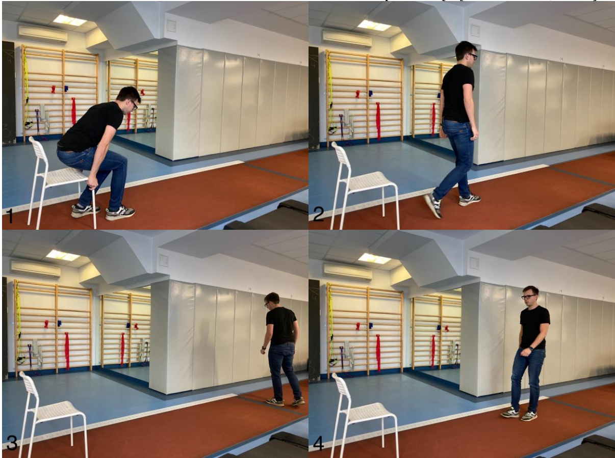
Figure 1. Timed Up and Go test.

TUG (Figure 1) is a first test in our protocol. The participant is asked to stand up from a chair (45 cm height) and walk forward at a comfortable pace, turn around beyond the line placed on the floor 3m from the chair and go sit back down in the chair. The patient is allowed to use hand support while standing up and sitting down or use crutches if needed. The results of TUG is time measured with a stopwatch (Bąkowski et al., 2020).