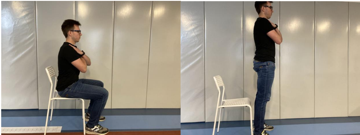
Figure 2. 5 Times Sit to Stand test.

To perform 10WT, the patient stands in an upright position and on rater's command starts to walk straight on as fast as possible to the finish line, which is marked on the floor 10 meters from the starting line. The participant is allowed to use crutches. Running is forbidden (Bąkowski et al., 2020). The results of 10WT is time measured with a stopwatch.